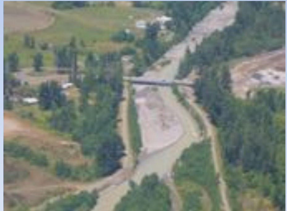
Calistoga Levee Setback on Puyallup River, WA.