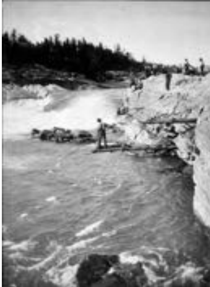
Kettle Falls Before Grand Coulee Dam, Largest Salmon Fishery in West