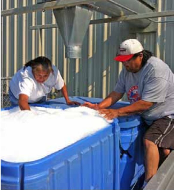
Through a special grant, Tribal FishCo provided free ice to fishers.

After a slow start, Tribal FishCo was formally created by the four member tribes to operate the White Salmon Fish Processing Plant. This marks the first time the four tribes have gone into business together and it offers great potential for the future. The processing plant was formally transferred to the tribes this summer and it conducted a test run during the fall fishing season, producing flake ice in the facility's high-capacity ice machine. CRITFC