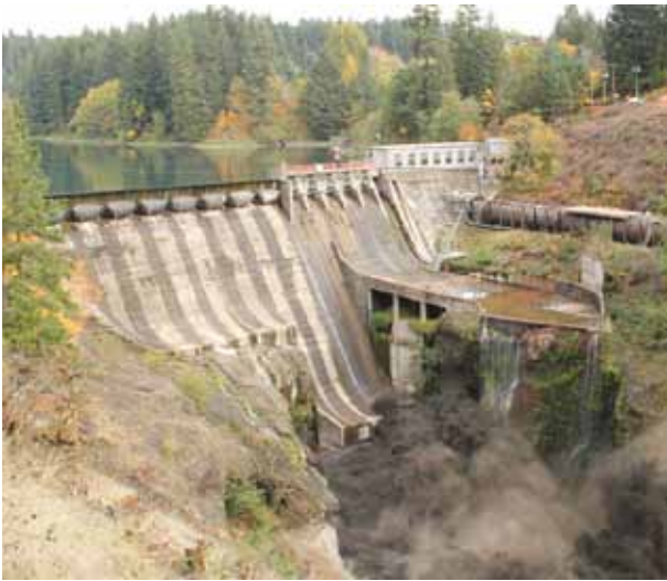
The freed White Salmon River rushes out of the breached Condit Dam after seven hundred pounds of dynamite opened a hole near the dam's base. The reservoir drained in less than two hours.

After blocking fish for nearly 100 years, Condit Dam on the White Salmon River was breached on October 26. This came after years of effort by the tribes and CRITFC, particularly the Yakama Nation. With the dam removed, salmon, steelhead, and lamprey will once more have access to over 30 miles of upstream spawning habitat. Now in the upcoming years, we will all be able to witness the healing of the river and the fish that return there.