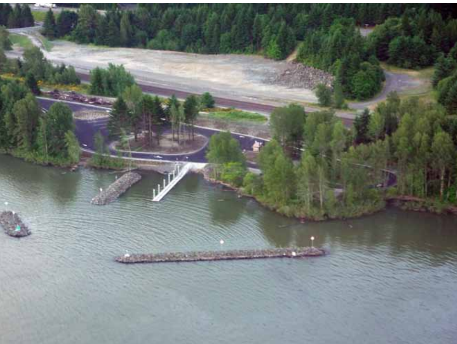
The new Wyeth Treaty Fishing Access Site.

This year, after intense education and pressure from the tribes, the State of Oregon increased its water quality standards to reflect the prominent role fish plays in the tribal diet. The study used as a basis for this change was conducted by CRITFC almost 15 years ago. Prior to this change, Oregon based its water quality standard on people eating only an ounce or two of fish a day. People eating more than this, a large number being tribal members, were potentially exposed to higher amounts of contaminants. The increase standard is now the strictest in the nation and protects all Oregonians, even those who eat salmon every day.